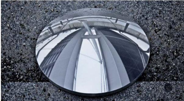
Fig. 1 - MSA®-Calotte which are made out of the new sliding alloy derive their shine from a special surface treatment